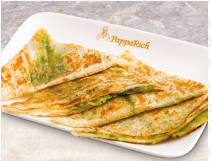
C08. Roti Kaya $13 90 印度加央抛饼 MUST TRY Roti Canai with our homemade kaya (coconut jam) throughout the bread.