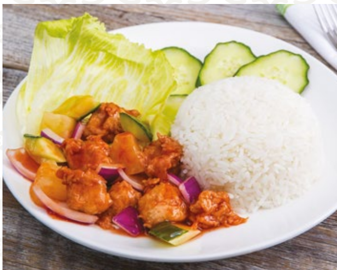
V07. Vegetarian Sweet & Sour Chicken (Mock Meat) with Rice $23 50 甜酸素鸡肉饭

Fried thin vermicelli noodles served with Vegetarian Curry Mutton, beancurd skin, sliced cucumbers, tofu, and lettuce.