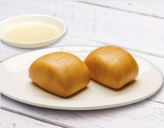
B20. Deep Fried Mantau with Condensed Milk $8 00 炸馒头 + 炼奶