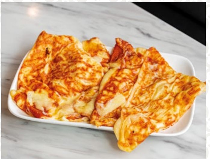
C24. Cheese Roti $13 90 印度起司抛饼 Roti canai with melted cheese.