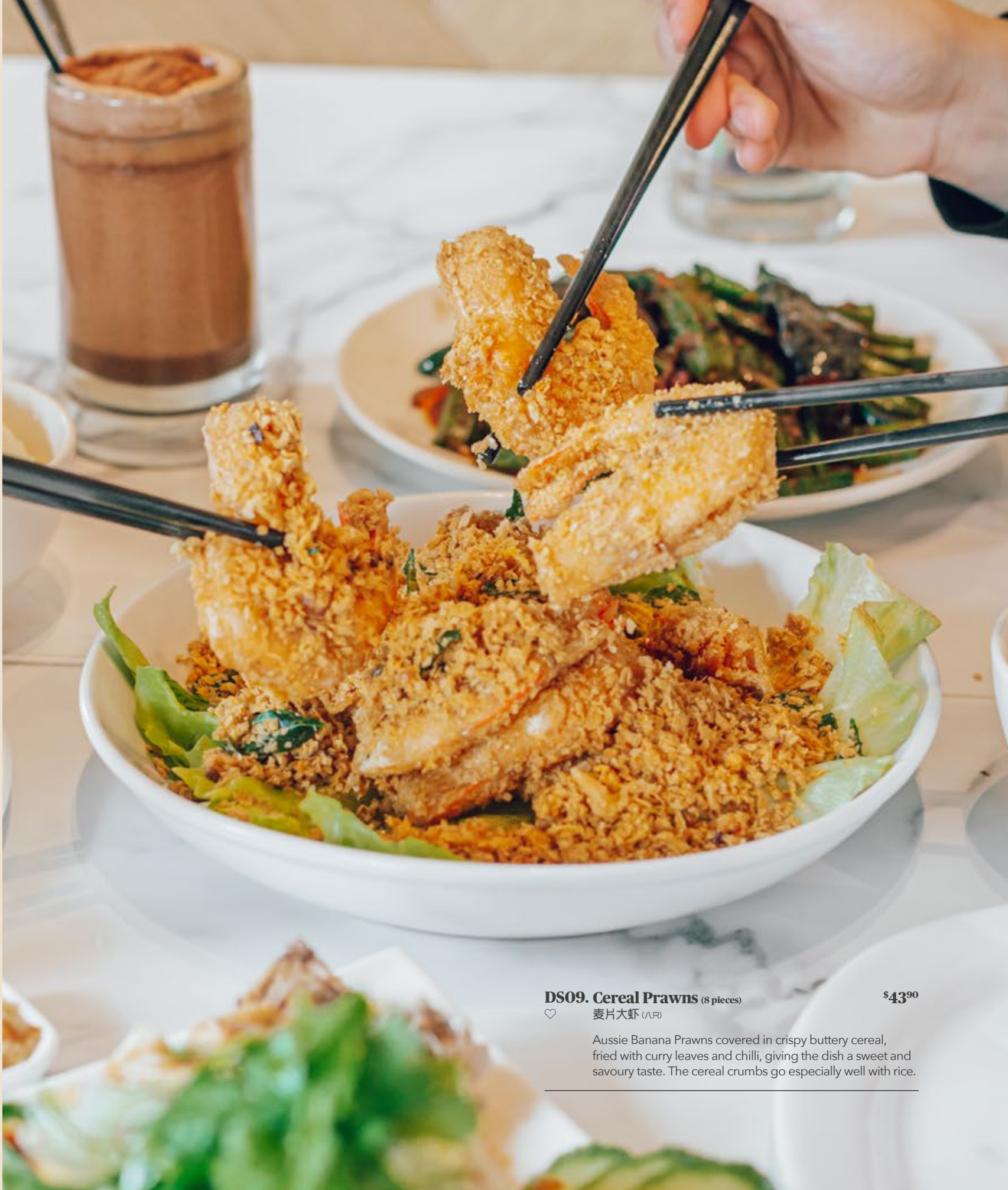
DS09. Cereal Prawns (8 pieces) 麦片大虾 (八只)