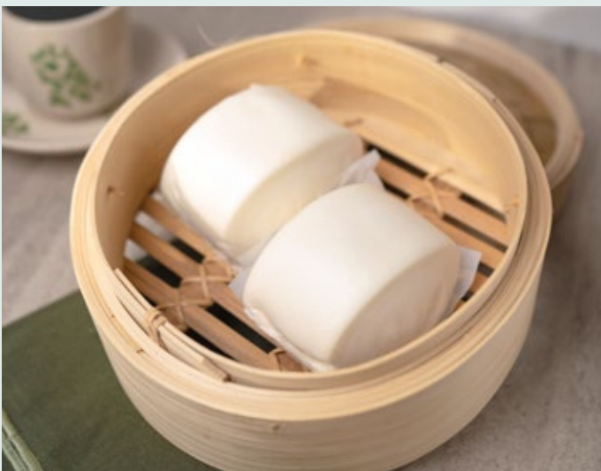
B17. Steamed Mantau Only (2 pieces) $7 00 蒸馒头 (两件)