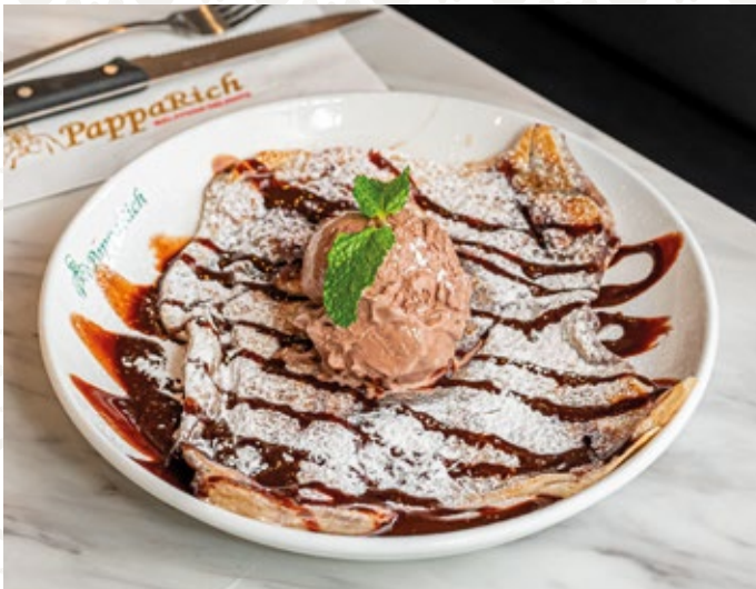
C23. Roti Nutella $16 90 印度抛饼 + 巧克力榛子酱 + 冰淇淋 Fluffy roti drizzled with creamy nutella and icing sugar served with a scoop of ice cream