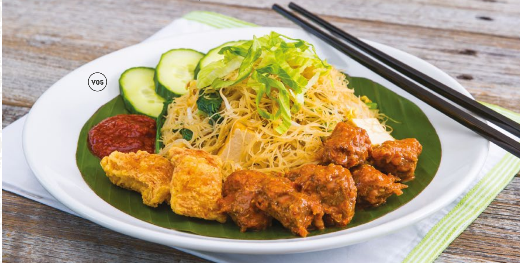
V05. Vegetarian Fried Mee Hoon with Egg and Vegetarian Curry Mutton (Mock Meat) $24 50 素炒米粉 + 鸡蛋与素咖喱羊肉

As promised, Pappa accommodates to everyone! We're calling all vegetarians! Not excluding those that are simply curious, this section is a recreation of our popular dishes from the other sections with a vegetarian touch. On the other hand, our delicious curry mutton is made from soy-based products that contain no preservatives, and that are trans-fat and GM free.