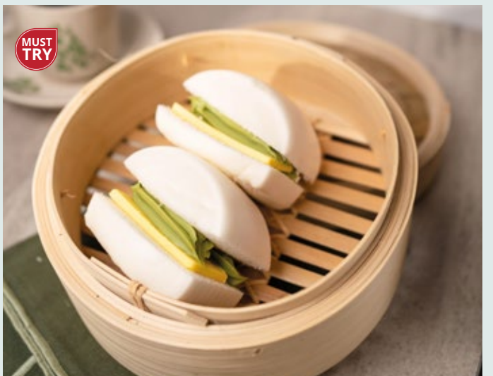
B16. Steamed Mantau with Butter & Kaya (2 pieces) $8 50 蒸馒头 + 牛油与加央 (两件)