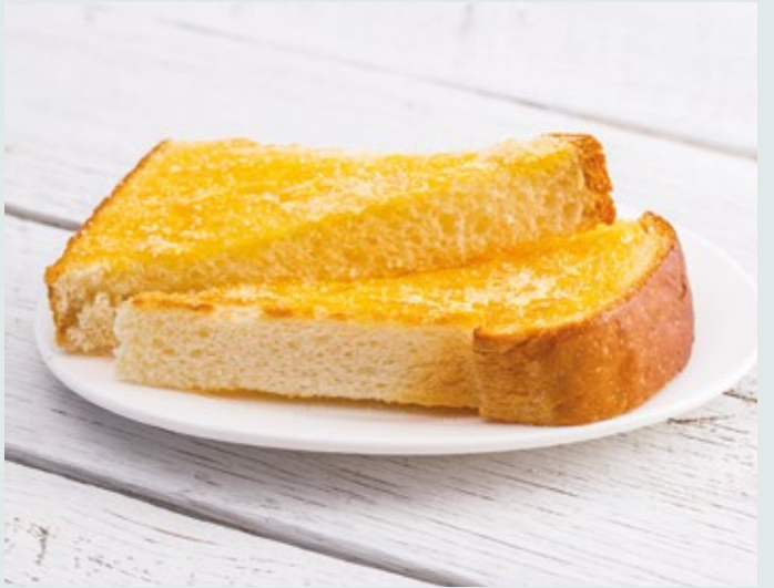
B10. Toasted Hainan Bread with Butter & Sugar $7 50 海南吐司 + 牛油与糖