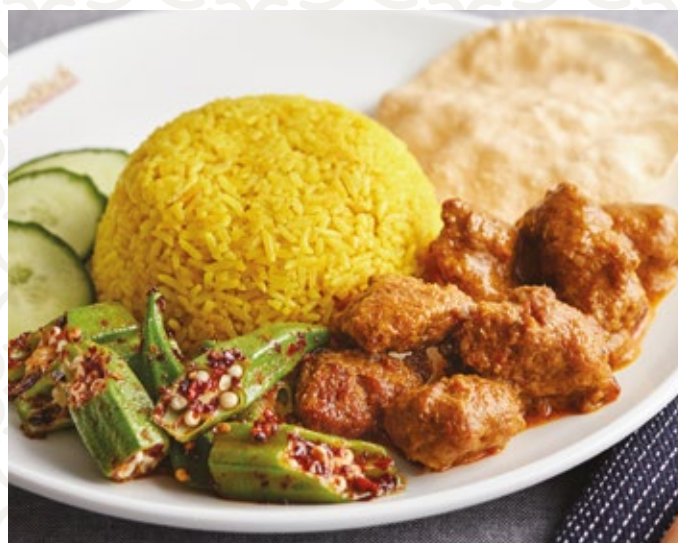
V13. Nasi Kuntit with Vegetarian Curry Mutton (Mock Meat) & Chilli Okra $24 00 黄姜饭 + 素咖喱羊肉与辣椒秋葵

Jasmine rice served with vegetarian sweet and sour chicken, pineapple, onion, cucumber, and lettuce.