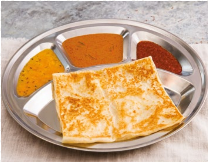
C07. Roti Planta $15 90 印度奶油抛饼 + 酱汁 Roti Canai with margarine and a dash of sugar throughout the bread, served with curry sauce, dhal and sambal.