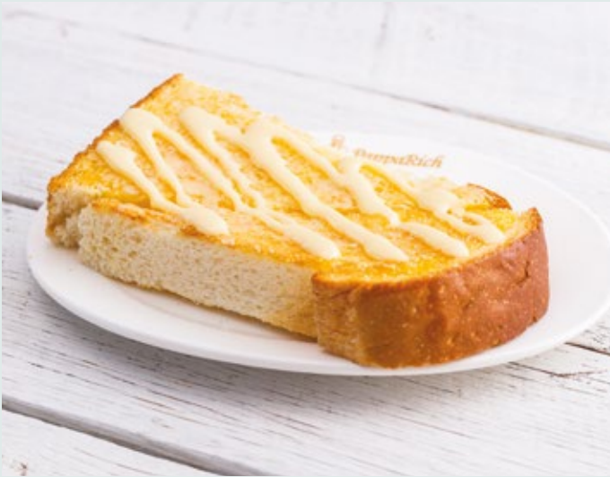
B04. Toasted Hainan Bread with Condensed Milk $8 00 海南牛油炼奶吐司