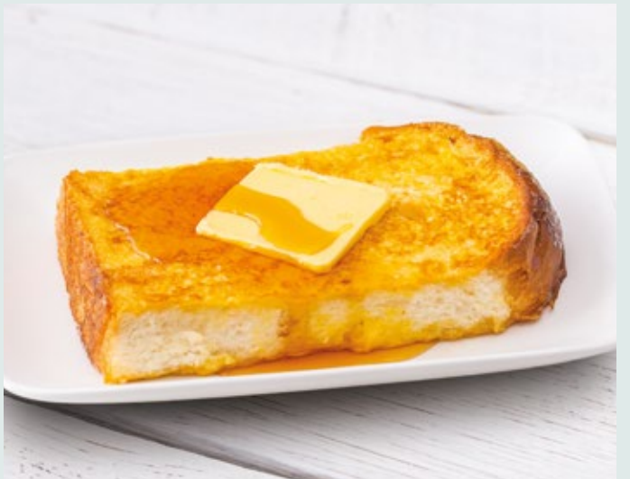
B11. Pappa French Toast with Butter $9 50 爸爸海南西多士