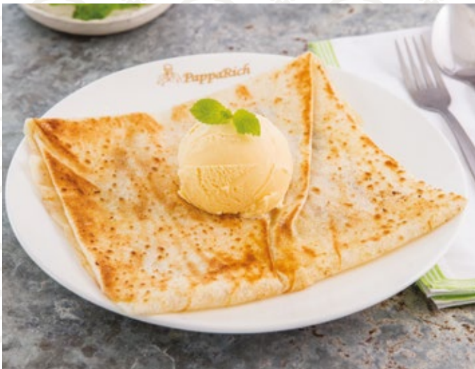
C15. Roti Banana with Vanilla Ice Cream $16 90 印度香蕉抛饼 + 香草冰淇淋 MUST TRY A sweet Roti dish with sliced banana cooked inside the dough.